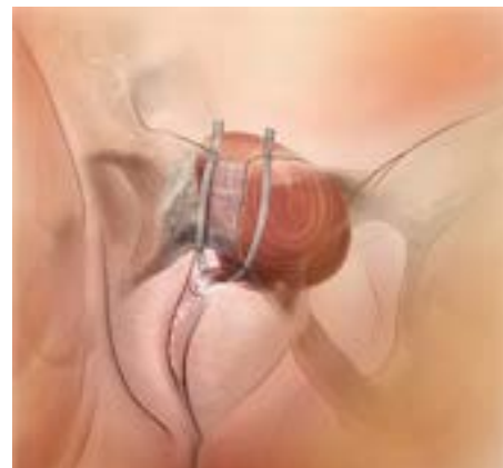
Figure 2: Retropubic Sling

The most common retropubic operation to be carried out is the TVT (Tension-free Vaginal Tape). This is also the operation that has been done for the longest time, and research suggests that if it is initially successful in controlling stress incontinence then it is still likely to be working up to at least 17 years later. The other retropubic procedures are likely to have similar long-term success rates.